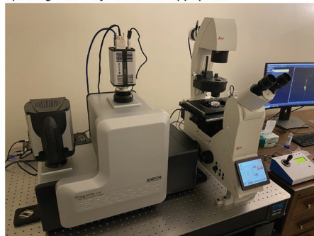
ANDOR Dragonfly 200 Spinning-Disk Confocal Microscopy System